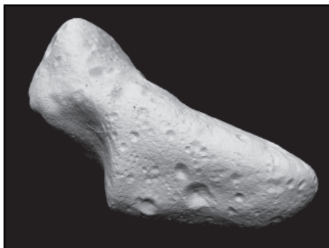
NEAR Project, NLR, JHU/APL, Goddard SVS, NASA

You usually hear that the span between the formation of Earth and the start of life is 800 million years. The correct figure is 4 billion